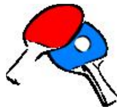
Table Tennis will be taking a rest in December as we all get ready for Christmas.

We will start again in January. Maybe this is a good time to make that New Year Resolution to come and join us in 2012?