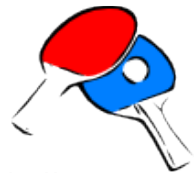
Table Tennis continues on Friday evenings in the hall at 7:30 pm.

All are invited to come and join us, young or old.