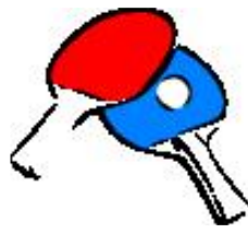
Table Tennis started back on 20th January in the church hall on Friday nights.

Please do come along and have a go, the more players we have the more fun we have.