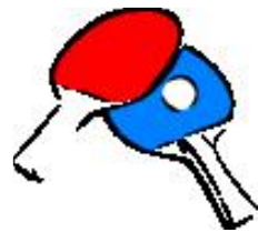
Table Tennis continues on Friday evenings in the Hall at 7.30 pm. We play each week that we think there will be enough of us for a game.